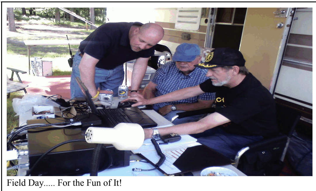
Field Day..... For the Fun of It!

Our next meeting is Tuesday, April 14; I expect a large attendance to discuss the upcoming Field Day. Your input is vital.